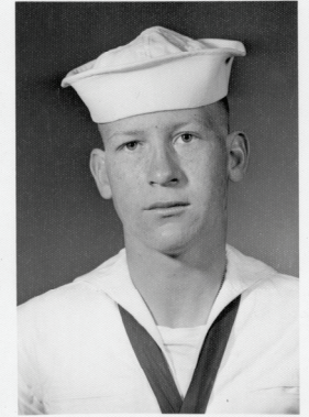
Bill served from 1960-62